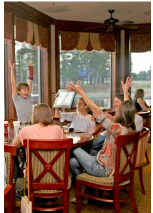
Get out to the Bar on April 20th for the next Trivia Night!