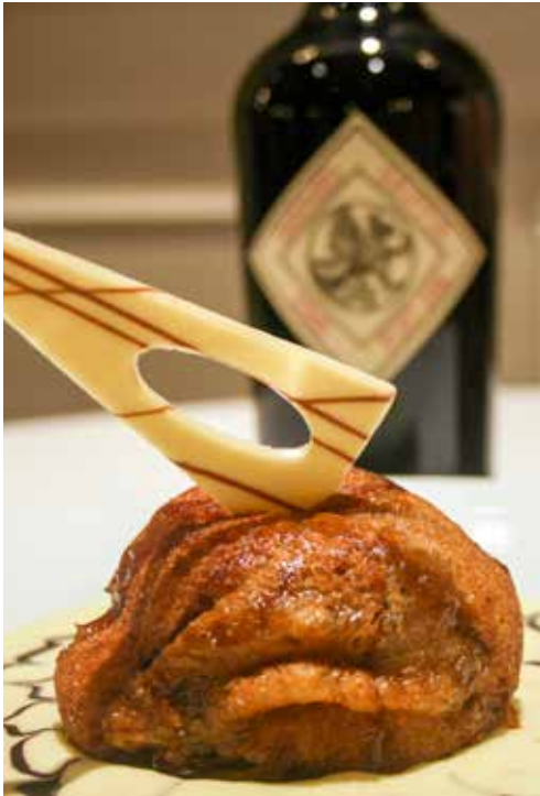
Enjoy expertly paired food and wine at the Wine Dinner on April 26th.