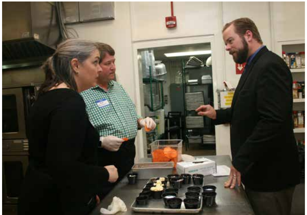
This event sells out fast! Don't miss our next Couple's Cooking Class on April 25th.