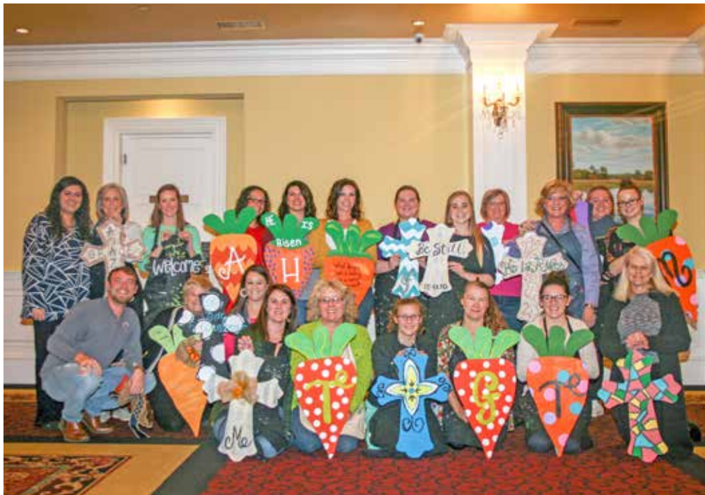
The ladies had an excellent time at Ladies' Paint and Wine! Keep your eyes out for more events like this one.