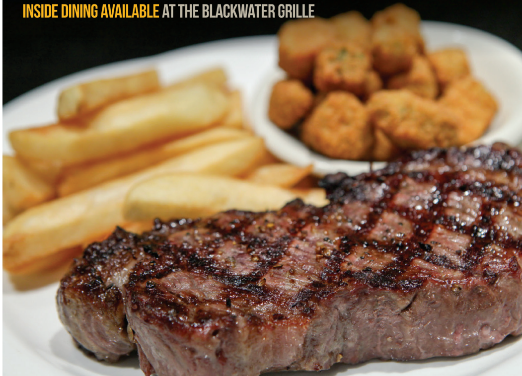
Pictured: Steak house cuts, weekly changes. OCC menu items subject to change at Chef's discretion.

INSIDE DINING AVAILABLE AT THE BLACKWATER GRILLE