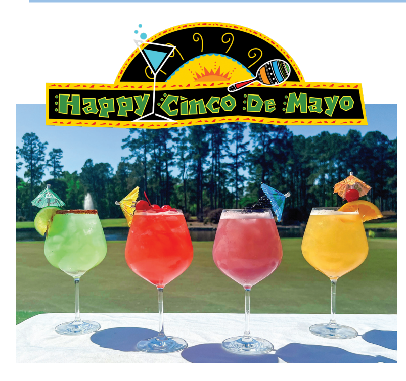
"Come out and try our variety of margaritas"

Coconut Mojito | Vodka, Malibu®, Crème of Coconut®, Fresh Lime Juice, garnished with Mint Рімм's | Pimm's, Lemon Juice, Ginger Ale, garnished with a Cucumber Slice