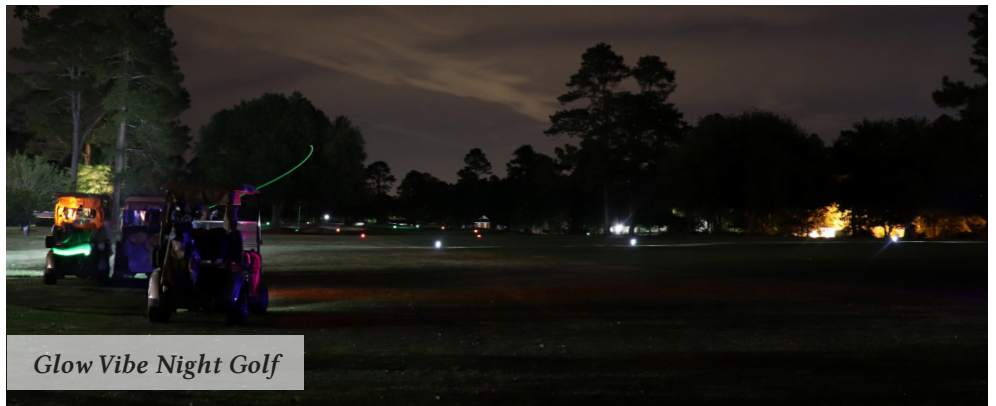
Glow Vibe Night Golf