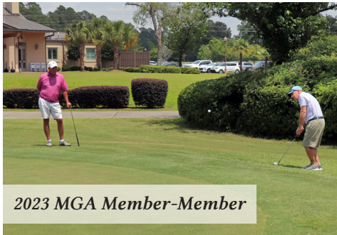
2023 MGA Member-Member

Our spring golf season is knocking on the door. Even as I write this, in mid-February, it is a nice 65-degree day. Much planning has gone into the 2024 tournament season, and there are still some t's to cross and i's to dot. The golf staff builds each year's events based on feedback that we receive, so please keep the feedback coming in. The biggest adjustment that has come from feedback, including a survey of 2023 participants and the Men's Golf Association (MGA) Roster, is moving the Annual Men's Golf Association Member-Guest later in the fall, to September 27-29, 2024. The response has been overwhelmingly positive with the move to cooler weather. Another tweak to the schedule is to have more club-wide events, not just