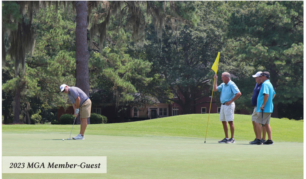
2023 MGA Member-Guest

Speaking of the MGA, It is a great way for OCC's men to meet other golfers and compete in some different formats. The annual dues of the MGA subsidize the MGA events throughout the season and assist in keeping the entry fees for the events low. Since those dues contributed to the events in 2023, if you have competed in an MGA event in the past year, you will be automatically added to the MGA roster. Also, if you are interested