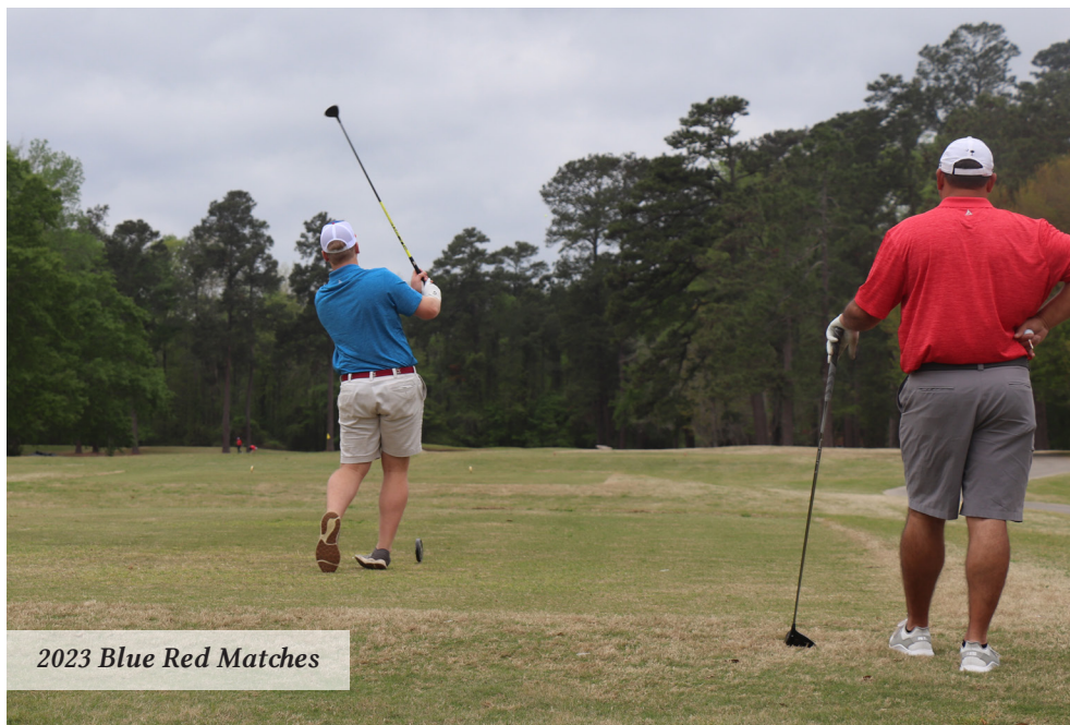
2023 Blue Red Matches