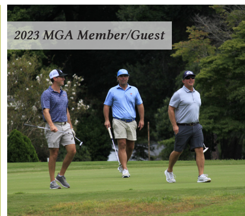
2023 MGA Member/Guest